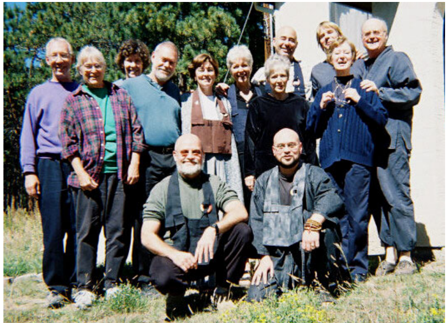
September, 2003 Sesshin fulltime Participants

◆ Changes in Sitting Schedules: 11/22: ½ day at Cockrells 12/6: Sat. Sit is at Kings 12/8: Mon. Sit is at Interfaith House